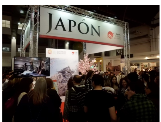
Overseas JNTO Event (Illustrative purposes only)