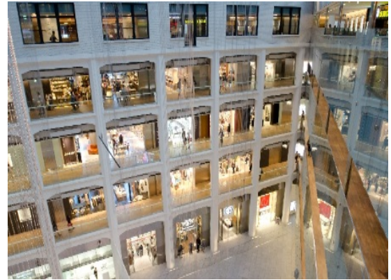
Commercial Facility in which Cool Japan Fund invested (Illustrative purposes only)

Cool Japan Fund and business entities in which the Fund has invested will provide necessary cooperation and personnel.